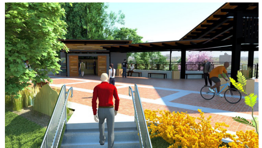
EAST GATE PLAZA RENDERING

Your support of Starry Starry Night and Walkway Over the Hudson will allow us to undertake significant projects to transform the Walkway experience during our next ten years. Become part of our Campaign To Sustain at walkway.org/donate .